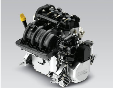
ROTAX® 900 HO ACE™ ENGINE