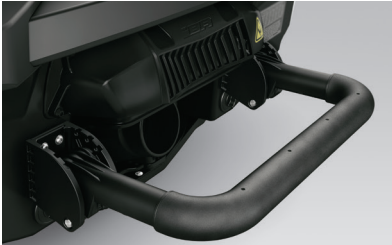
REBOARDING LADDER (ACCESSORY)

899 cc four-stroke, Rotax® with three cylinders in-line and four valves per cylinder The most compact and lightweight engine on the market today. The Rotax® 900 HO ACE™ incorporates crisp acceleration, impressive fuel economy and an excellent power-to-weight ratio.