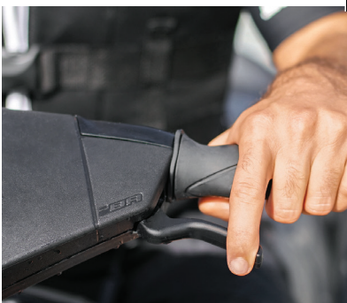
iBR® (INTELLIGENT BRAKE & REVERSE)